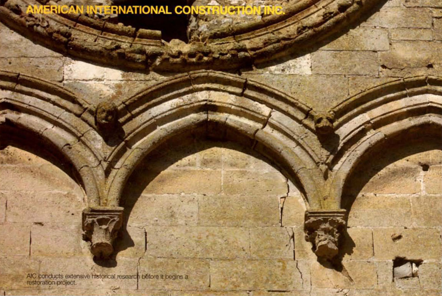
AIC conducts extensive historical research before it begins a restoration project.